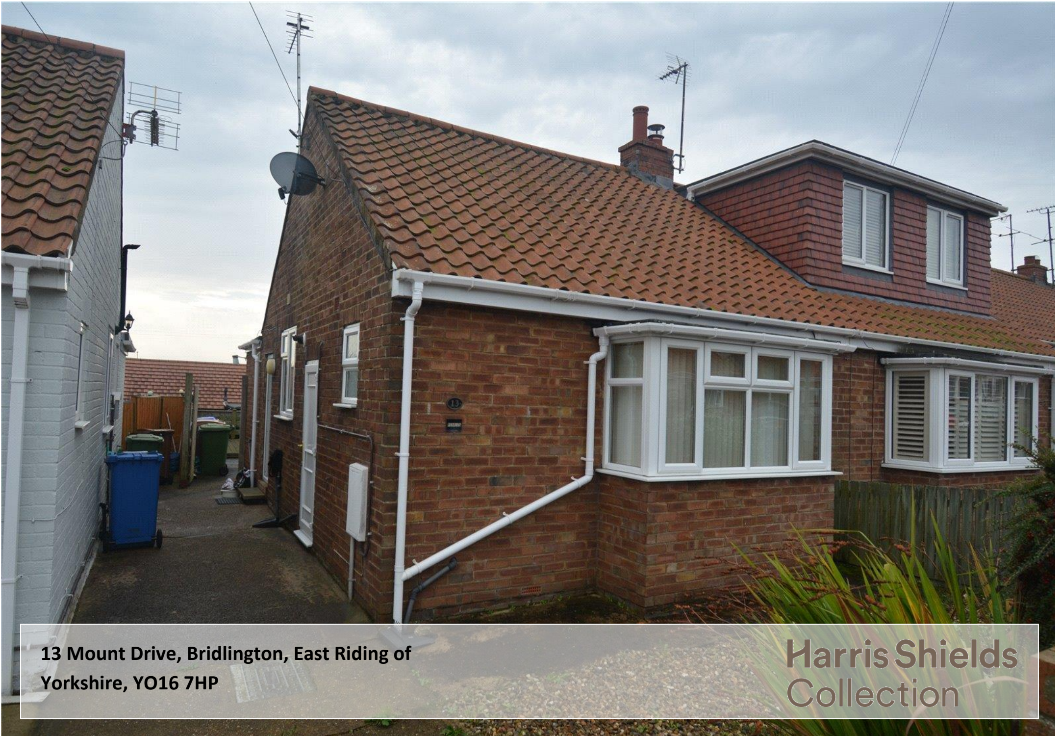
13 Mount Drive, Bridlington, East Riding of Yorkshire, YO16 7HP